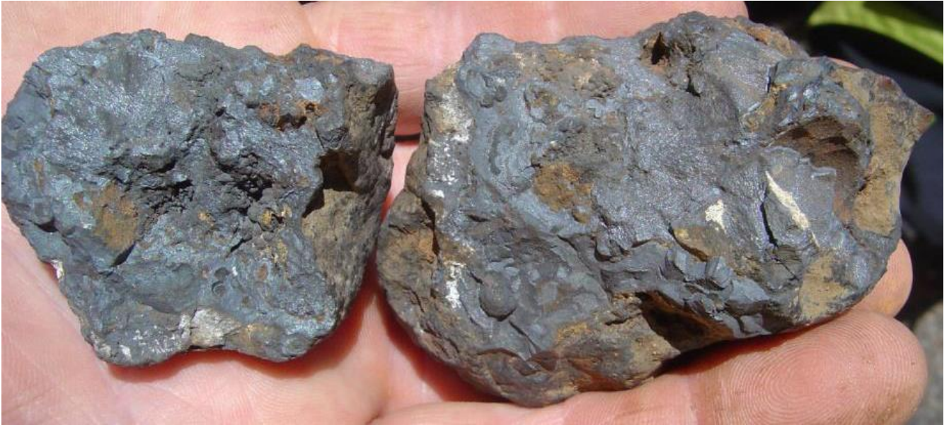
Figure 2 Historic sample MBLL returned significant multi-metal anomalous data